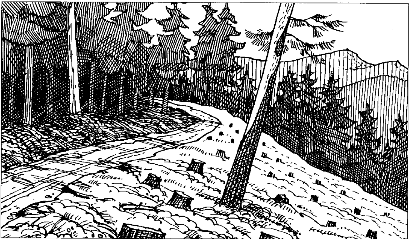
Wildlife trees may be left where they will cause little problem if they fall, such as along roads so they do not threaten to roll, fall or slide into the right-of-way.

The most productive cavity habitat will be present when a variety of trees species, diameters and heights are available throughout the woodlot. Conifers usually last longer than other species. In general, cavity trees less than 12 inches in diameter and less than 15 feet high provide the least amount of benefits. Also your woodlot should have a minimum of two pieces of large, downed woody material per acre in various stages of decay. These pieces should be 10 feet long to be