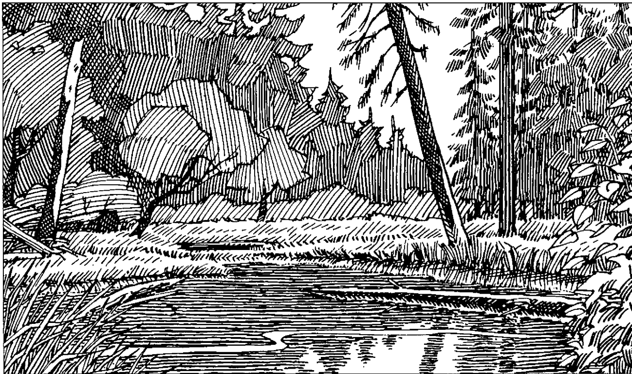
Wildlife trees can be left along lakes, ponds or streams, especially where the lean is over water or along the edge away from work area.

Cavity trees can be a hazard to vehicles, buildings, powerlines, fences and workers if not